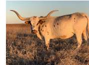
ROSEY WHITE WINE