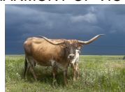
HARMONY OF VICTORY